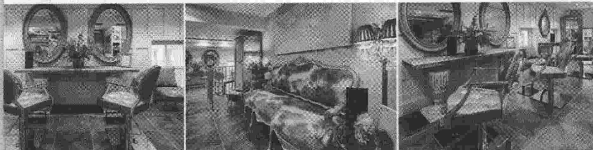
Taylor & Taylor at Liberty - London