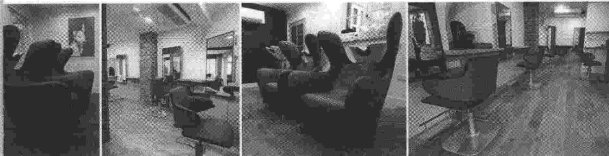
Tristan Eves - Petworth, West Sussex