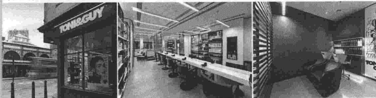
Tony & Guy - Spitalfields - London